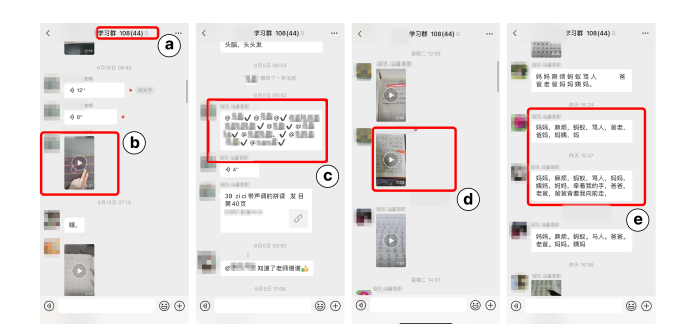
Figure 3: S7 showcased interactions with fans in a WeChat group. Streamer posted daily instructional videos (b) in a tiered fan group (a), Streamer checked fans' assignments (c), and tagged specific members to provide feedback, Fans posted their assignments in video format (d), and Fans posted their assignments in text format(e).

(2) Supportive Community in Group Chat. Group chats also served as a means to build a supportive learning community. Streamers regularly posted daily learning tasks, which focused on practicing essential literacy skills in writing, typing, and speaking. Fans were encouraged to participate by submitting assignments and showcasing their learning outcomes. They could submit their assignments in different formats, including videos(see figure 3(d)), voice messages, or written text(see figure 3(e)). Streamers also reviewed the assignments, checked the learning outcomes, and provided feedback in the group chat(see figure 3(c)).