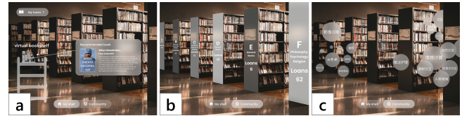
Figure 1: Low-fidelity prototype. (a) AR personal bookshelf. (b) Augmented bookshelves. (c) Comments bubble.

presenting customized book recommendations through an AR personal bookshelf. (2) Augmented Bookshelves. Overlays digital information on bookshelves, such as each category’s book loan volumes. (3) Comments Bubble. Visualizes virtual comments from other readers as AR bubbles near relevant books, fostering a sense of community within the library.