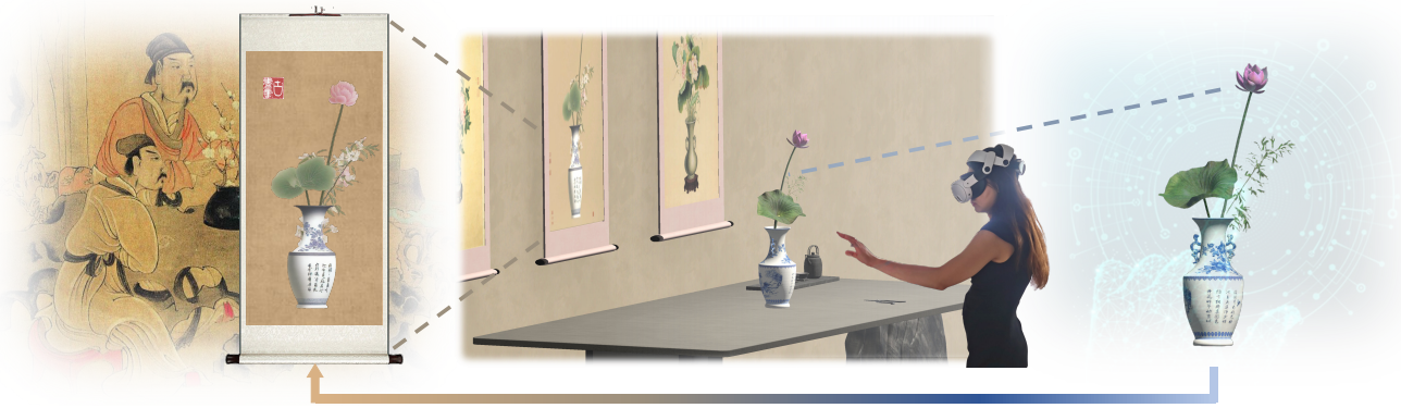
Figure 1: Timeless Blossoms, a VR-AI system where users craft 3D floral designs that generative AI transforms into real-time Xieyi paintings, merging traditional art with technology for cross-cultural and temporal dialogue.

The Hong Kong University of Science and Technology (Guangzhou) Guangzhou, China The Hong Kong University of Science and Technology Hong Kong SAR, China mingmingfan@ust.hk